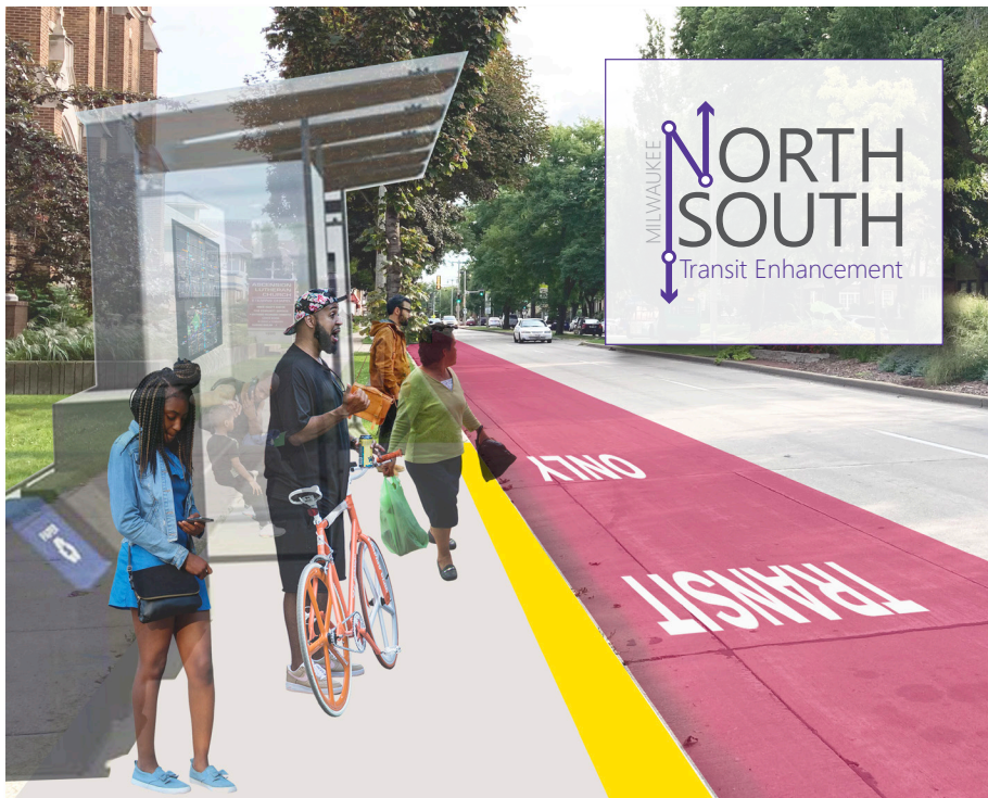
Bus rapid transit station concept