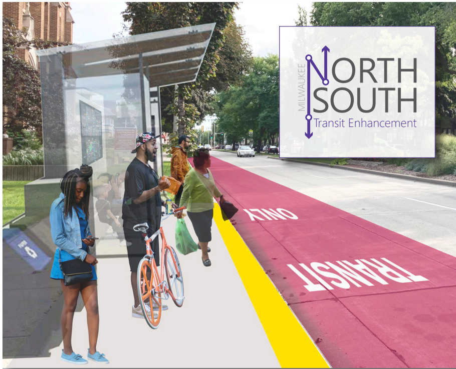
Bus rapid transit station concept